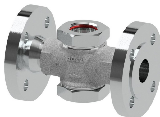
DN 15 to DN 25