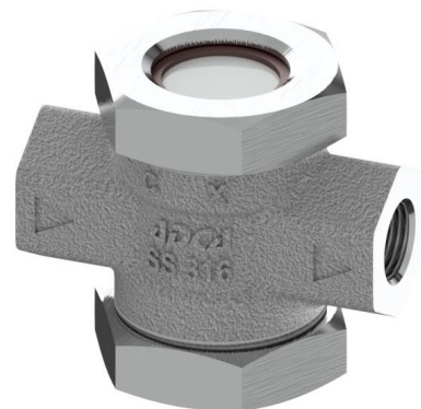
1/2" - 1"