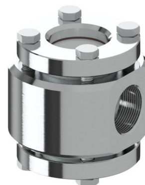
1 1/4" - 2"